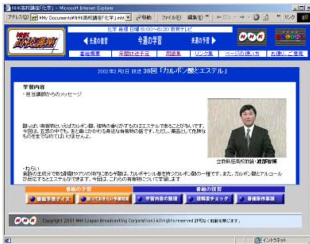
Figure 2: Top page of Prototypical Web Site for Chemistry Lesson #38.

For the Post-viewing Study, content of the TV program was made available sequentially, based on the storyboard of the program. Such visuals as diagrams on flip charts and pictures of experiments were reused from TV program's resources.