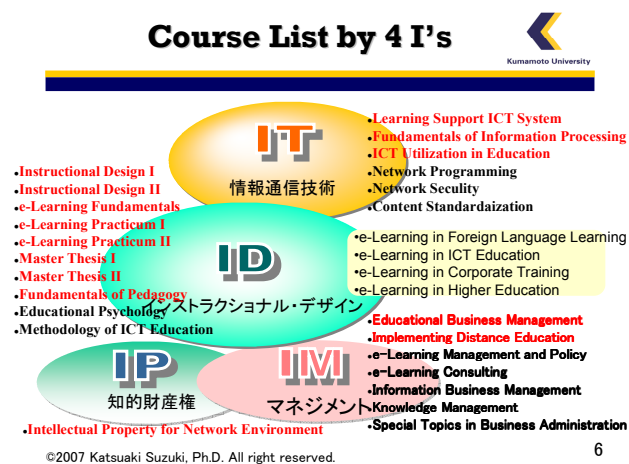
Figure 1. GSIS course list clustered into four emphases

It is a regular master program that requires two years of study, taking a minimum of 30 credit hours. Figure 1 lists courses of the program clustered into the four I's. Each course runs for 15 weeks, for two credits. Twelve courses are required to complete a Master's program, whereas 16 elective courses are offered from which four or more courses be taken as a part of the Master's program.